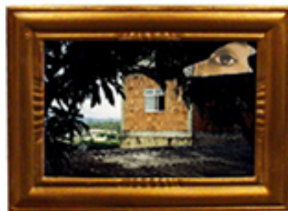
The population of the favelas