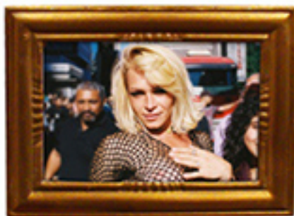
The transgender community

A small-sized exhibition (5cm x 7cm frames), made to call attention to the way minorities are treated in Brazil. The pictures are placed near the floor to translate the idea that diversity is like an underestimated work of art. The viewers have to be on their knees in order to see the photos.