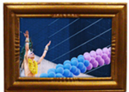
The LGBT community